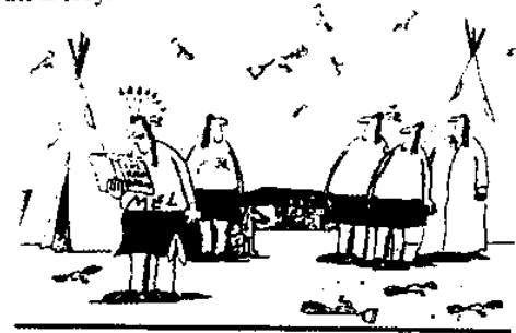
Oh! Four steps to the left and then three to the right... What kind of a dance was I doing?"

"While employed at the I. O. Krick WX. Assoc., besides writing about 30 weather forecast scripts a day for broadcast to radio stations from the Midwest to California to the Pacific Northwest, Making forecasts for utility companies, fruit and distillery operations and an occasional forecast for a Powder Puff Derby."